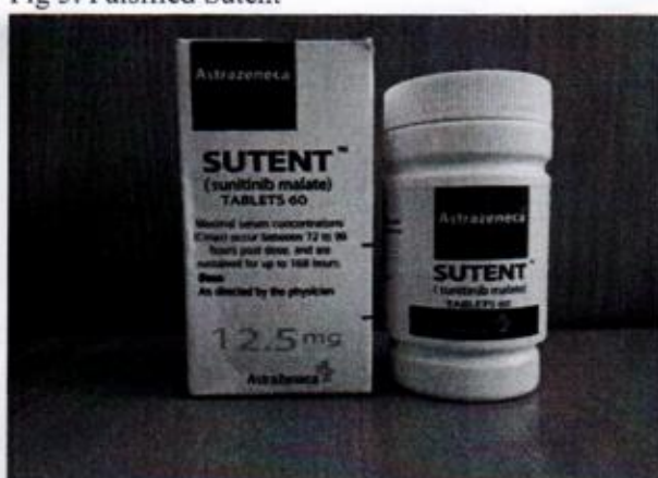
Fig 3. Falsified Sutent