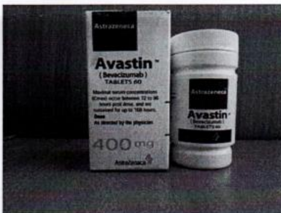
Fig 1. Falsified Avastin